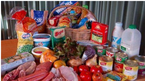
Victorian Healthy Food Basket – 44 nutritionally balance items.

The DVD 'Food for Life' is now completed. This DVD describes the local issues and solutions relating to